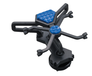
SMF-1 Shock Mount for F1