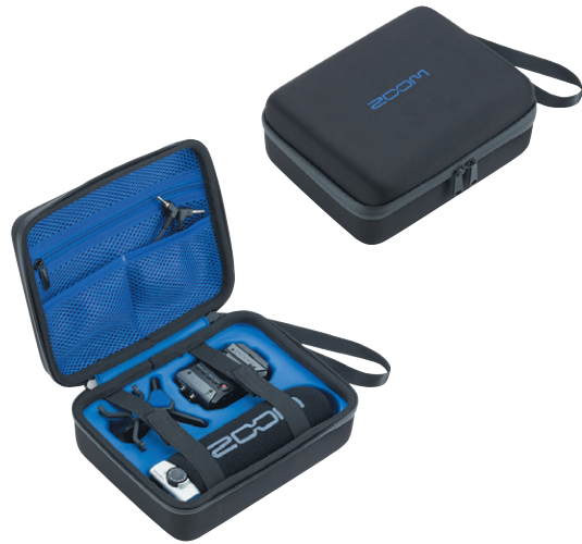
CBF-1SP Carrying Bag for F1-SP