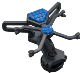
SMF-1 Shock Mount for F1