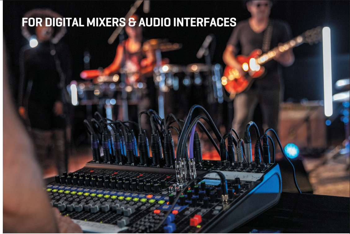
CBL-20 Carrying Bag for L-20 / L-12