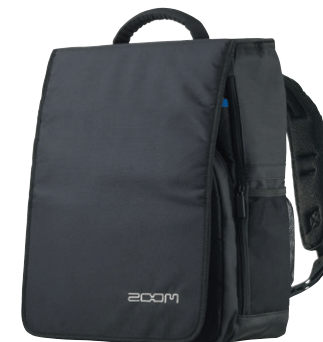
CBA-96 Creator Bag

The Creator Bag has two padded shoulder straps which are adjustable, and a top handle for easy transport. The back of the bag is also padded for extra comfort when carrying it over your shoulder.