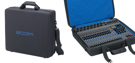
CBL-20 Carrying Bag for L-20 / L-12