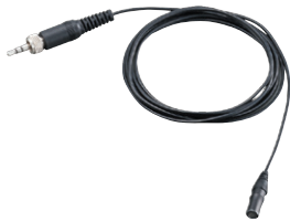
LMF-2 Lavalier Microphone for F1