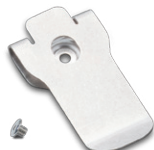
BCF-1 Belt Clip for F1