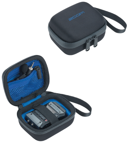
CBF-1LP Carrying Bag for F1-LP