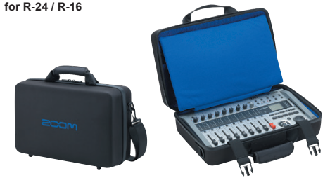
CBR-16 Carrying Bag for R-24 / R-16