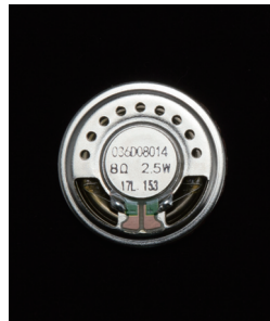
Icom custom high power handling capacity speaker