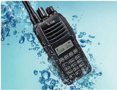
Waterproof for 30 minutes at one meter