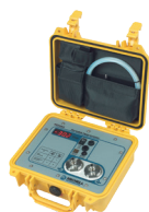
MDM50 Portable Hygrometer