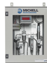
ES20 Compact Sampling System

Michell Instruments adopts a continuous development programme which sometimes necessitates specification changes without notice. Issue no: MDM300_97156_V9.7_EN_0223