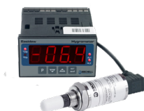
Easidew Online Dew-Point Hygrometer