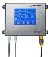
Optidew 501 Chilled Mirror Hygrometer