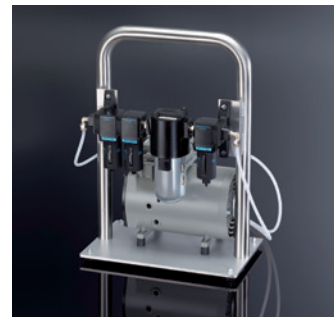
External pump with filter and air dryer unit for pressure and vacuum