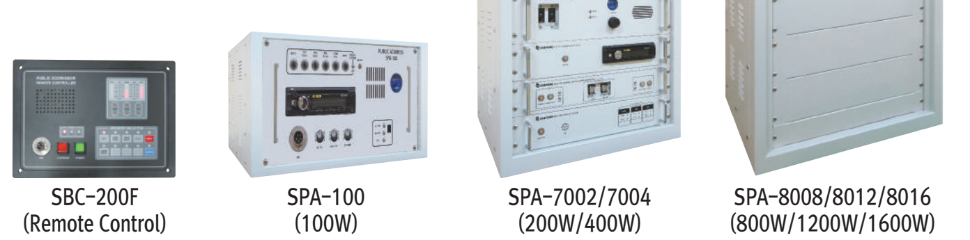
SBC-200F (Remote Control)