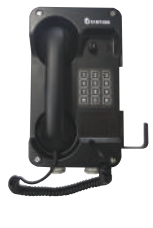
SAW-301 (Wall Type)