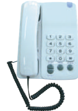
SAD-200A (Desk Type)