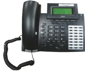
SDK-24B (Digital Telephone)