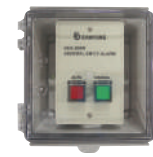
SEG-942W (Wall Type)