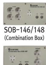
SOB-146/148 (Combination Box)