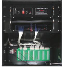
SME-144D (Telephone Exchanger)