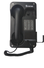
SAW-401 (Flush Type)