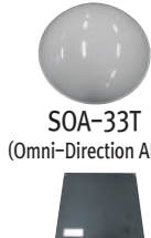
SOA-33T (Omni-Direction ANT.)