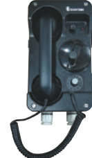
SSW-301 (Wall Type)