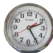
SC-3W (3 Hand Slave Colok)