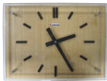
SC-2WA (2 Hand Slave Colok)