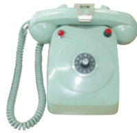
SCD-100 (Desk Type)