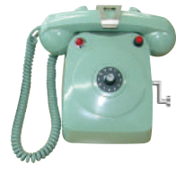
SSD-100B (Desk Type)