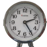
SC-2W (2 Hand Slave Colok)