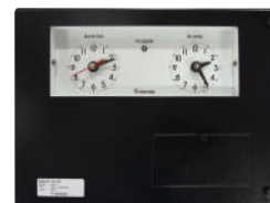
SMC-1/4 (Master Colok : GPS Interface)

* Specification is subject to change without notice