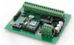
Addressable output module (open-collector)