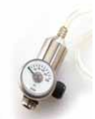
Test gas cylinders and regulators