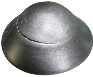
ERICHSEN Cupping Test