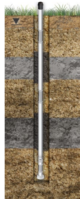
Typical 3 or 7-Channel CMT Installation in Overburden using Layers of Bentonite and Sand Backfilled from Surface