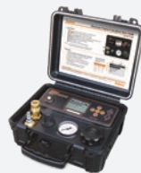
Model 464 Electronic Control Unit