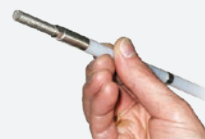
Model 408M DVP 3/8" (9.5 mm)