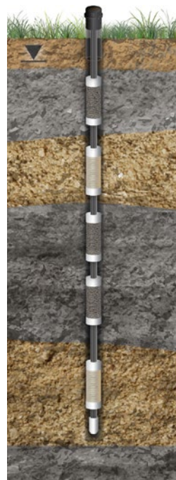
Typical 3-Channel CMT Installation in Overburden with Bentonite and Sand Cartridges

Saves Cost – through reduced permitting and drilling costs; and because narrow tubes allow smaller purge volumes, reduced disposal costs, efficient low flow sampling and rapid response to pressure changes, all reduce field time.