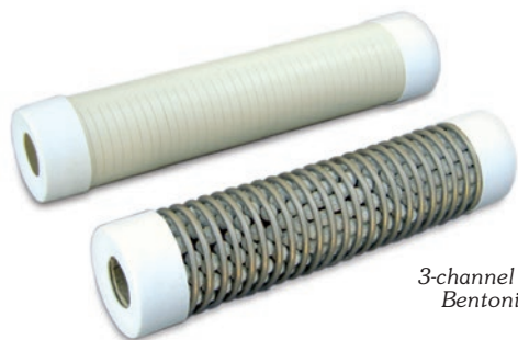
3-channel CMT Sand and Bentonite Cartridges

These cartridges are approximately 2.4" (61 mm) in diameter and will fit inside various direct push drill rods. Ideally, the borehole diameter these bentonite cartridges are used in should not exceed a nominal 3.5" (90 mm), to ensure proper expansion and sealing.