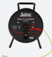
Model 102 Water Level Meter

Vapor Samples: A special Vapor Wellhead Assembly can be used to obtain depth discrete vapor samples.