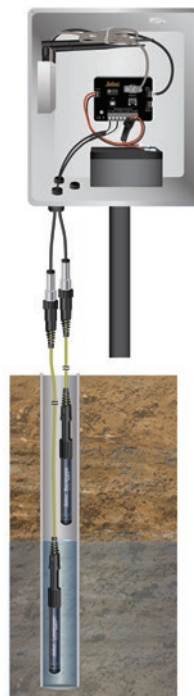
STS Edge Remote Station