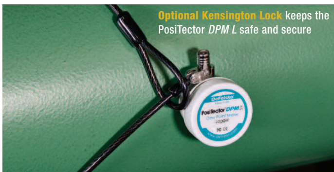
Optional Kensington Lock keeps the PosiTensor DPM L safe and secure

Operating Range: -10° to 60° C (14° to 140° F)