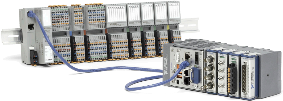
Figure 1. NI Remote I/O System