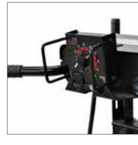
Remote control holder