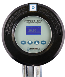
XTP601 Process Oxygen Analyzer