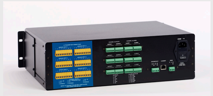
Rear panel input/output connections

The rear panel has segregated hazardous and non-hazardous area connections and a single RS485 port for ease of connection, with an additional ethernet port for Modbus TCP/IP connectivity. Both 85...264 V AC and 20...28 V DC power options are available.