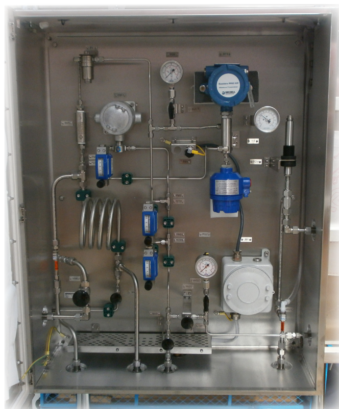
ES70 Sampling System examples