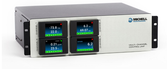
Multi-Channel Unit Promet I.S. / Liquidew I.S Moisture Analyzer

Michell Instruments adopts a continuous development programme which sometimes necessitates specification changes without notice. Issue no: Multi-Channel Process Monitor_97631_V1_EN_0523