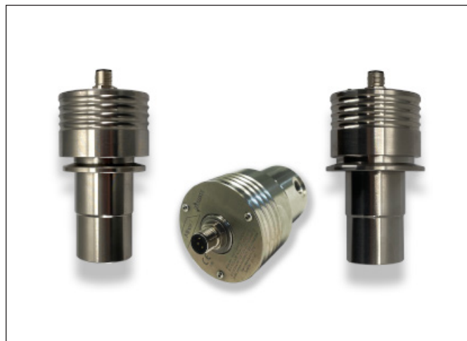
Minox-i Intrinsically Safe Oxygen Transmitter

See the Michell ES70 Sampling System datasheet for full details.