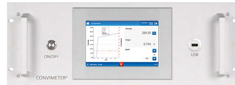
Control unit with integrated touch screen