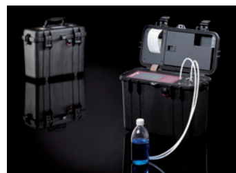
Rugged case PAMAS GO

All versions are optionally available in the robust PAMAS GO housing.